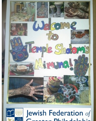
Greater Philadelphia CENTER for ISRAEL & OVERSEAS